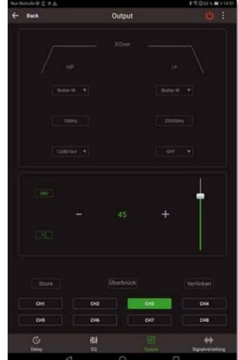
The crossovers can also be set with the app, as well as runtime, level etc