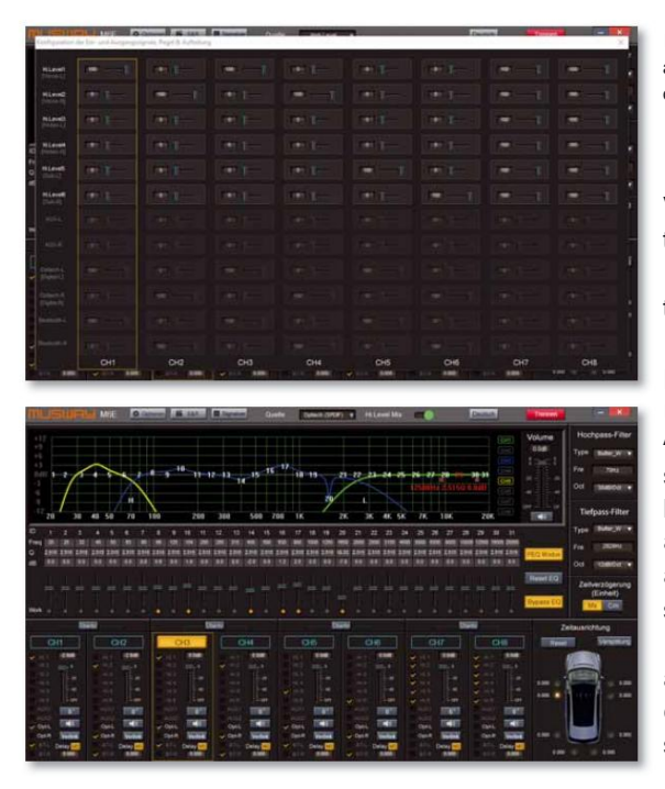
The main window offers everything at a glance. An easy operation is not a problem on the PC

The four existing RCA jacks are distributed over two processed outputs and the analog aux-in. There is also an optical digital input and a USB interface for a Bluetooth dongle, which is not included in the delivery. The main inputs, as well as the loudspeaker outputs are designed as Molex plugs, a practice that saves space and is becoming more and more prevalent. The M6 can take a total of 6 high-level channels, so that no signal is lost, even in more complicated systems. All inputs can be routed to all outputs, whereby even the levels can be set from 0 - 100, so that an arbitrary summation can be made. In order to bypass diagnostic