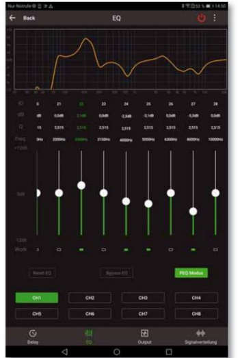
The app offers almost ful functionality, here with equalizers and frequency response

software makes a very good impression. And if you consider that the M6 is a small and still affordable power amplifier, you can