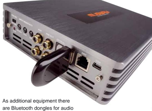
are Bluetooth dongles for au streaming and app control

functions of the factory system, the inputs are so low-impedance designed that for a whole range of cars an error-free operation should be given.