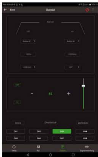
The crossovers can also be set with the app, as well as runtime, level etc.