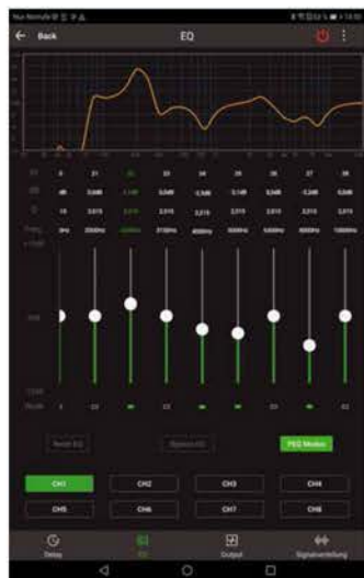
The app offers almost full functionality, here with equalizers and frequency response